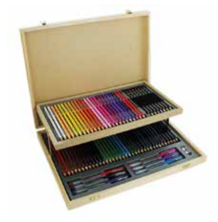
The Works: Wooden stationery set, £10