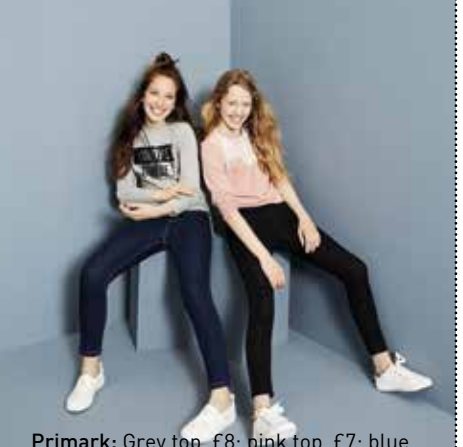
Primark: Grey top, £8; pink top, £7; blue jeans, £4; black jeans, £5.50