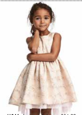
H&M: Jacquard dress, £14.99