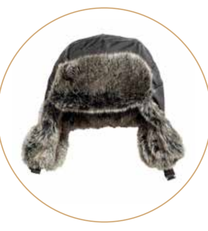
H&M: Hat with earflaps, £12.99