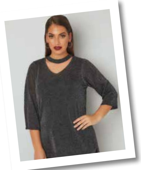
Yours: Black & silver metallic fine knit top with choker neck, £26.99