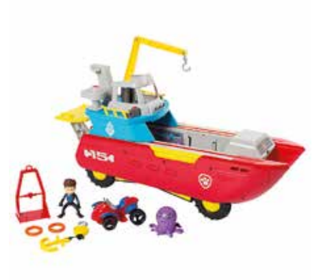
The Entertainer: Paw Patrol Sea Patroller, £64.99