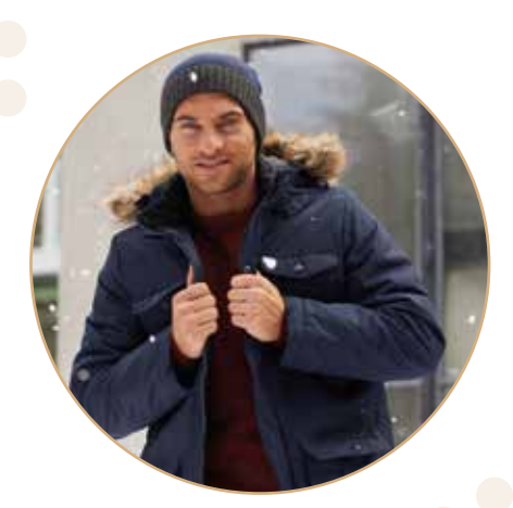
Pep&Co: Jacket, £25; jumper, £9