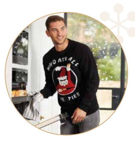
Pep&Co: Jumper, £9; jeans, £9