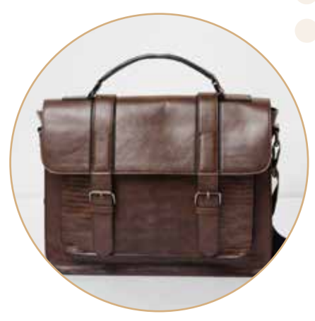
River Island: Brown snakeskin front buckle satchel bag, £35