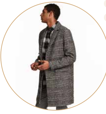
H&M: Wool blend coat, £79.99