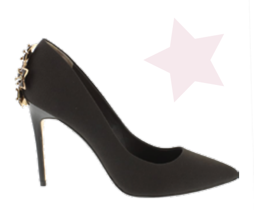
Robert Goddard: Ted Baker Zephari crystal floral embellished courts, £170