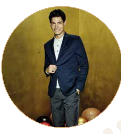
Burton: Blazer, £45; jumper, £28; trousers, £25