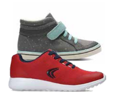
Clarks: Top: Comic Peg Infant Boot, £32; Bottom: Sprint Free Junior, £32