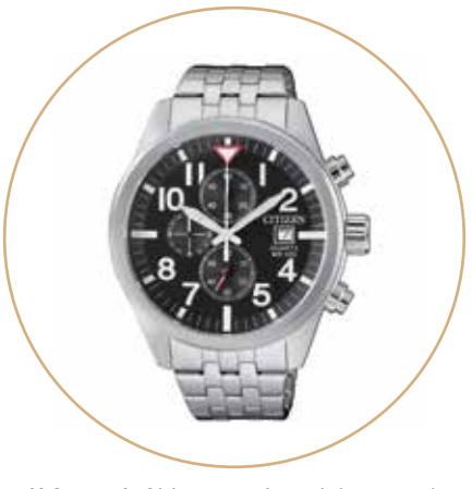
H Samuel: Citizen men's stainless steel bracelet watch, £99.99