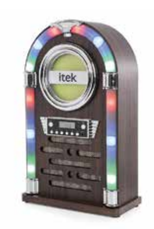
The Works: ITEK Bluetooth Jukebox with CD Player and FM Radio, £39.99