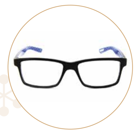
Vision Express: Ted Baker designer glasses, £199 (including single vision lenses)