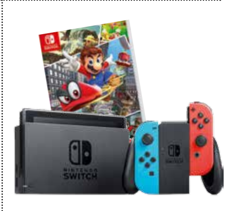
Game: Nintendo Switch console, £279; Super Mario Odyssey game, £49.99