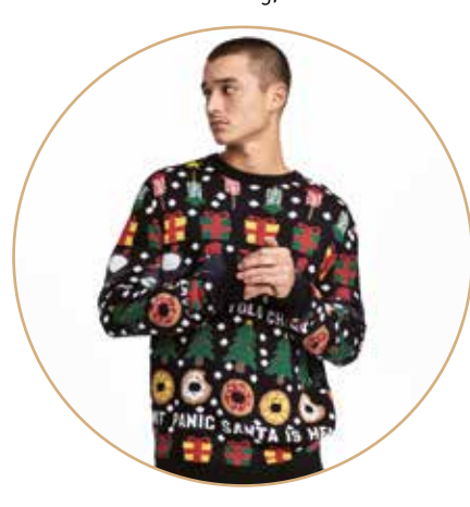
H&M: Jacquard-knit Christmas jumper, £17.99