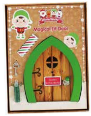
The Works: Magical Elf Door, £3

You'll find a great selection of children's presents and stocking fillers in Corby Town Shopping and Willow Place at hard to beat prices. Whether it's tech, toys or top fashion, there's something for kids of all ages. Make Corby your one stop shop this Christmas!