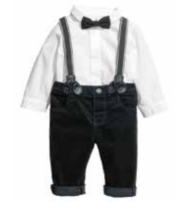
H&M: Baby shirt and trousers, £19.99