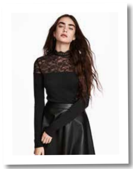
H&M: Fine-knit jumper with lace, £12.99