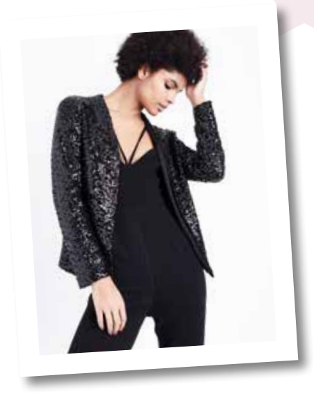
New Look: Black sequin blazer, £34.99