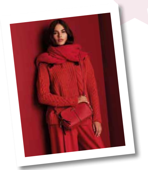
River Island: Cable knit high neck jumper, £40; trousers £45; scarf, £20; bag, £28

Fashions, jewellery, accessories and pampering products – gifts to inspire, delight and cherish for the lady in your life. We've all your favourite High Street brands and more in Corby Town Shopping and Willow Place!