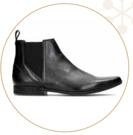
Clarks: Glement Top boot, £65