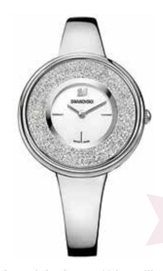
Grace & Co: Swarovski Crystalline Pure watch, £249