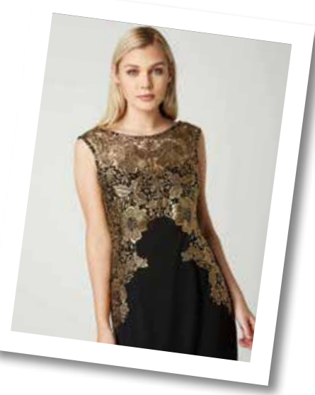
Roman: Gold leaf foil lace detail dress, £50