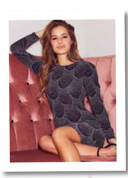
Dorothy Perkins: Petite silver puff sleeve bodycon dress, £29