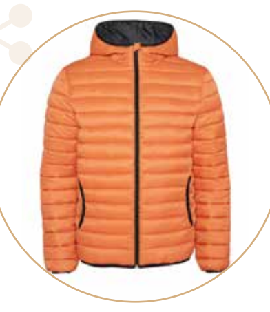
Primark: Orange padded coat, £15