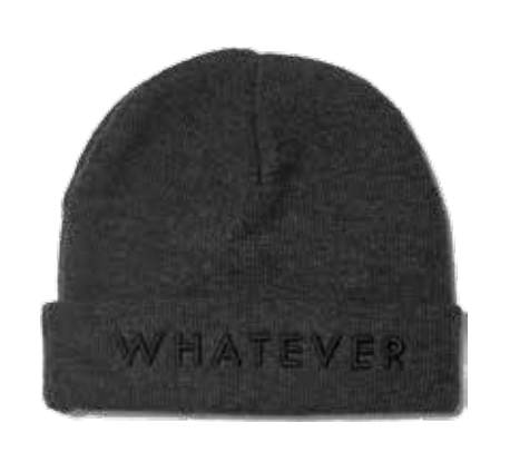
River Island: 'Whatever' beanie hat, £8