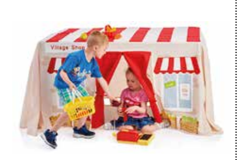
Wilko: Over the Table Play Shop, £25