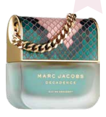
Boots: Marc Jacobs Decadence Eau So Decadent Eau de Parfum 50ml, £64