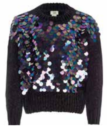
River Island:iridescent sequin chenille jumper, £22