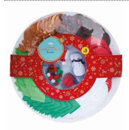
Wilko: Christmas Foam Craft Platter, £3