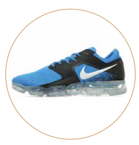
JD Sports: Nike Air Vapormax Mesh, £150