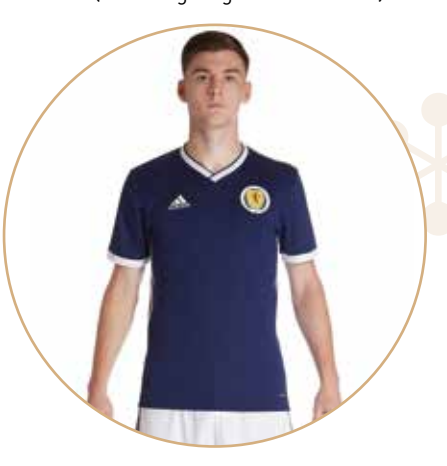
JD Sports: Adidas Scotland 2017/18 home shirt, £60