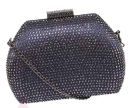
Dorothy Perkins: Navy gem lock clutch, £25