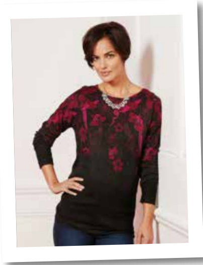
Bonmarché: Trailing floral print tunic, £24