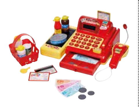
Wilko: Cash register, £12