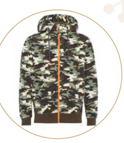
Primark: Camo fleece hoodie, £9