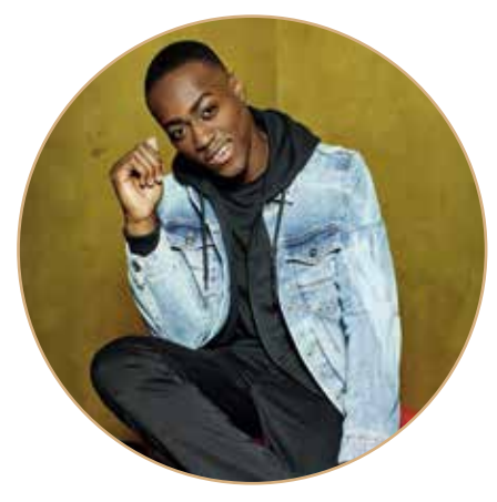
Burton: Hoodie, £26; jacket, £40; jeans, £30