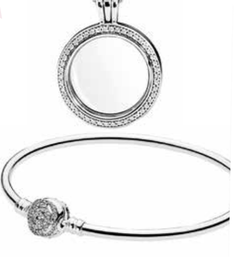
Pandora: Disney, Moments Beauty & the Beast bangle, £80