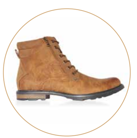
Primark: Tan military boot, £20