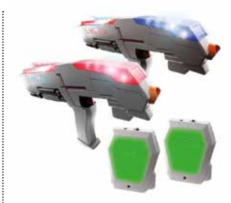
The Entertainer: Laser X, £44.99