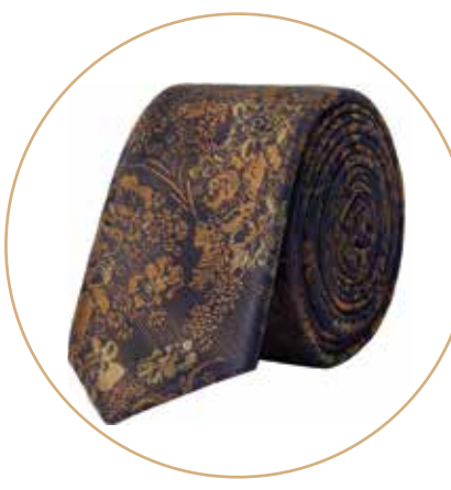
River Island: Floral print tie, £12