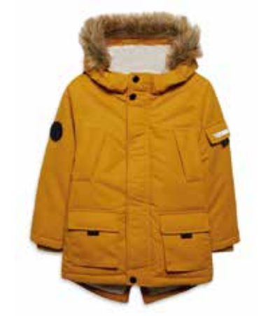
Primark: Yellow parka jacket, £16