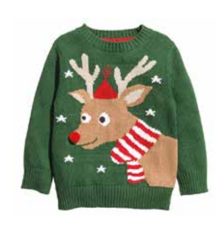
H&M: Knitted cotton jumper, £12.99