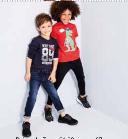
Primark: Tops, £1.80; jeans, £7