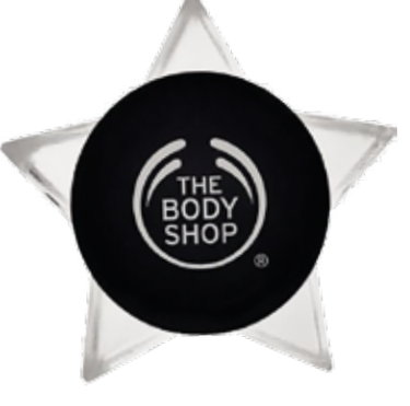
The Body Shop: Glitter Dust, £7