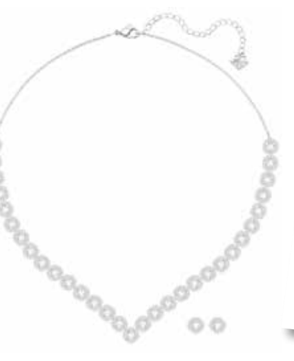
Grace & Co: Swarovski Angelic Square Set necklace, £159