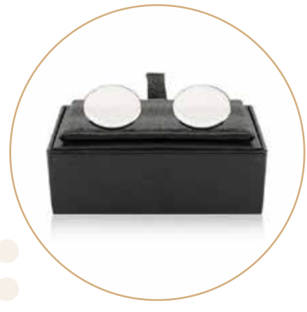
Superior Services: English Pewter Company silver-plated cufflinks, £11