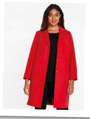
Evans: Red longline formal coat, £75