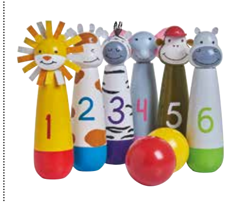
Wilko: Safari Wooden Skittles, £7