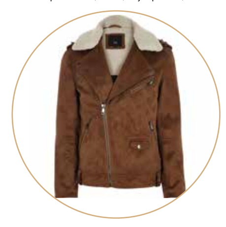
River Island: Tan faux suede borg biker jacket, £75