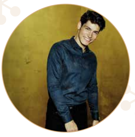
Burton: Shirt, £32; trousers, £25